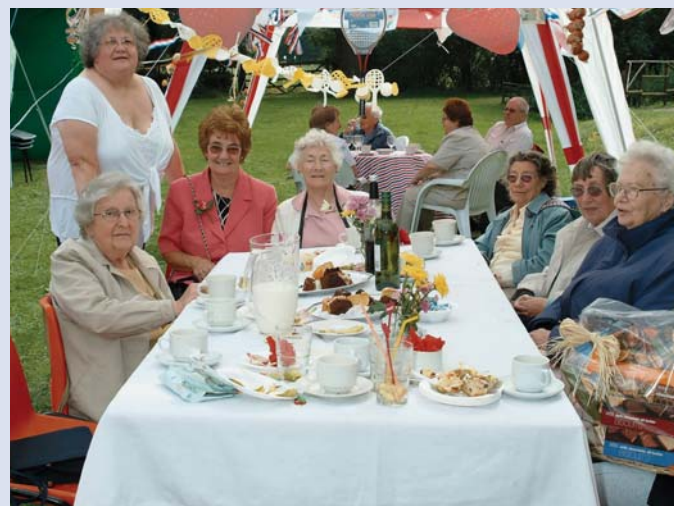
Tolworth shop win best dressed gazebo competition.