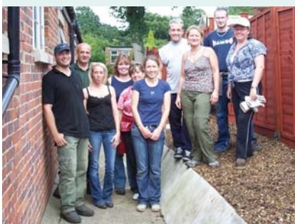
A spot of gardening for UNUM team.

We are justly proud of our unique multi-disciplinary team where our balanced and integrated education, therapy and living skills provision is recognised by OFSTED, the Adult Learning Inspectorate, the National Association of Specialist Colleges, the Commission for Social Care Inspection and the South Thames Brain Injury Rehabilitation Assoc.