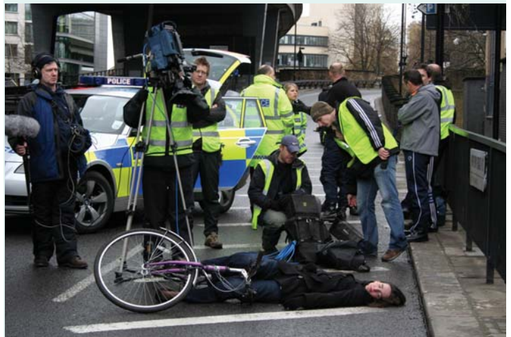
BBC filmcrew reconstruct a traffic accident to solve the crime.