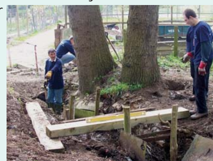
Friends Provident rebuilding a bridge.

These projects are very often at the heart of a team building exercise where colleagues get to work together in an area totally unrelated to their normal roles and without the regular management structure.